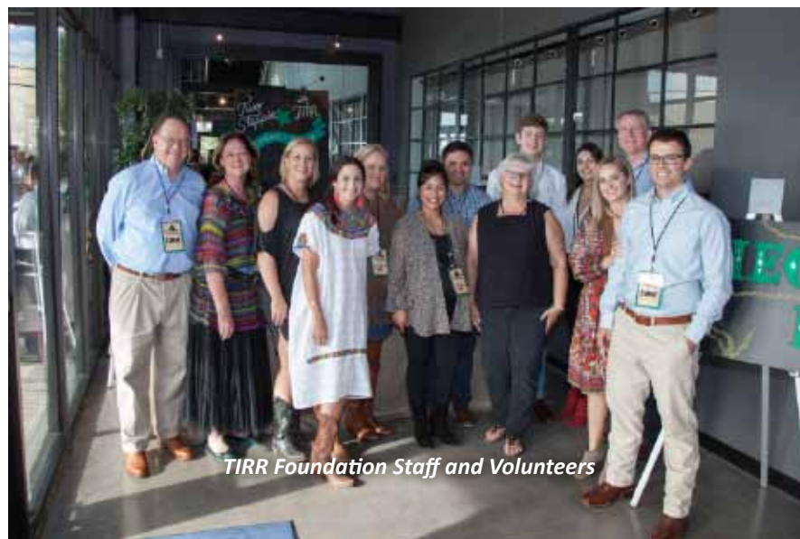
TIRR Foundation Staff and Volunteers